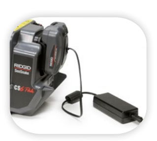
AC Battery Adapter