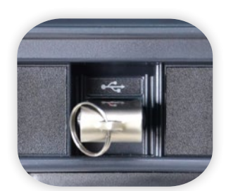
Direct-to-USB Recording (8 GB USB key included)

SeeSnake® HQ™ Software to edit, archive, and deliver reports via print, DVD or online