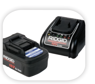
Rechargeable 18 V Advanced Lithium 4.0 Battery